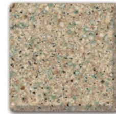
Tea Leaf - L