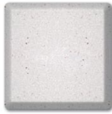
Mont Blanc - L