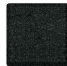
Green River - L