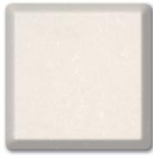
Yukon Blanco - L