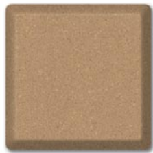
Beige Olimpo - L