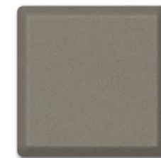
Grey Expo - L