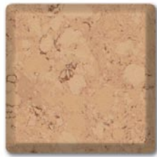
Yellow Nile - L