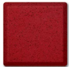
Stellar Fire - L