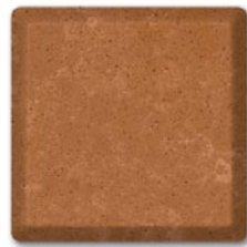
Sonora Gold - L