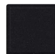
Tebas Black - L