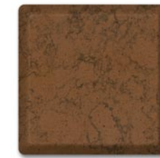
Santa Fe Brown - L