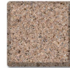
Kona Beige - L