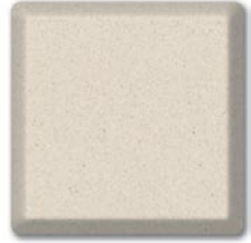
White North - L