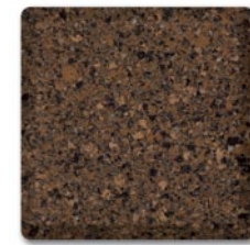
Brazilian Brown - L