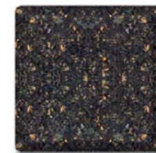
Rainforest - L