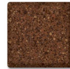
Mahogany - L