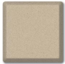
Minerva Cream - L