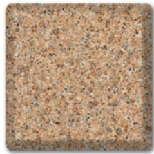
Amarillo Palmira - L