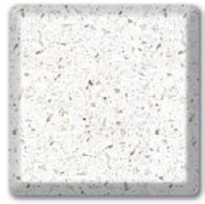
Blanco Maple - L