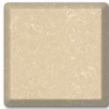
Caramel Rhine - L