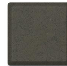
Grey Amazon - L