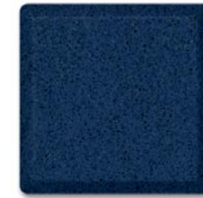
Stellar Marine - L