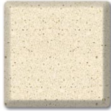
Capri Limestone - L