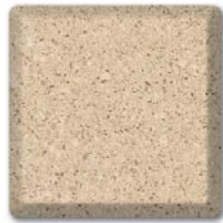
Ivory Coast - L