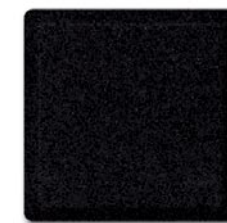
Stellar Night - L