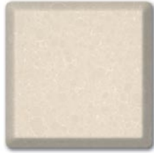
Tigris Sand - L