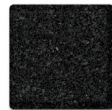
Ebony Pearl - L