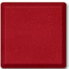
Red Eros - L